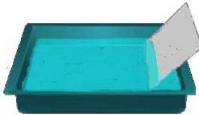
pan, water, mirror