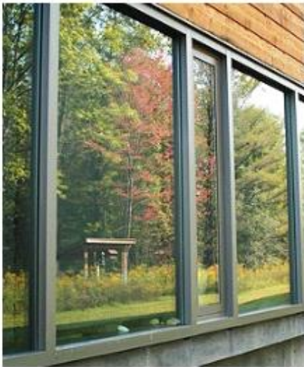
window with sun shining in